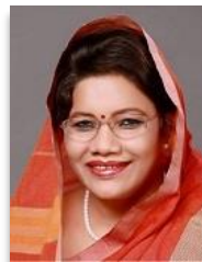
Minister of State, Smt. Renuka Singh Saruta