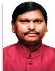
Minister of Tribal Affairs, Shri Arjun Munda

On 15th May 2020, Hon'ble Minister of Tribal Affairs, Shri Arjun Munda launched GOAL initiative, a Facebook funded program in collaboration with the Ministry of Tribal Affairs, aimed at upskilling and empowering tribal youth across India to become digital young leaders. This event was also graced by the presence of Hon'ble MoS, Smt. Renuka Singh Saruta.